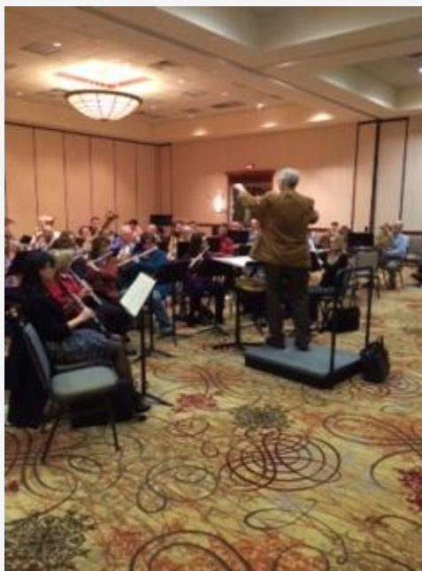
Phi Beta Mu Holds Annual Clinic